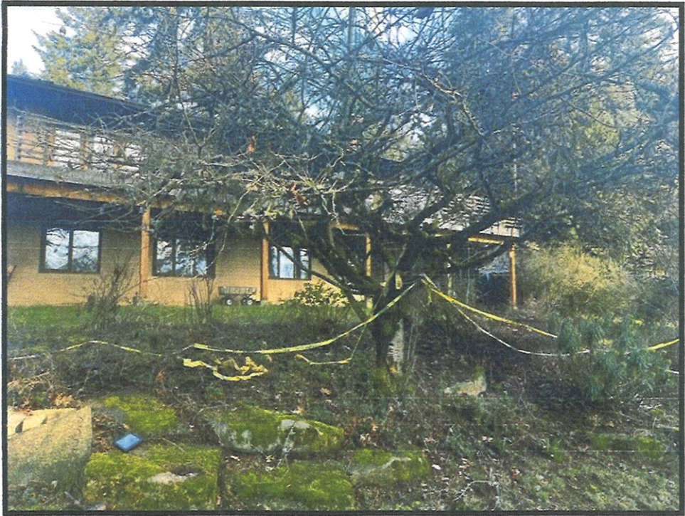
Photo 2. Tree 2, Flowering cherry, in front yard.