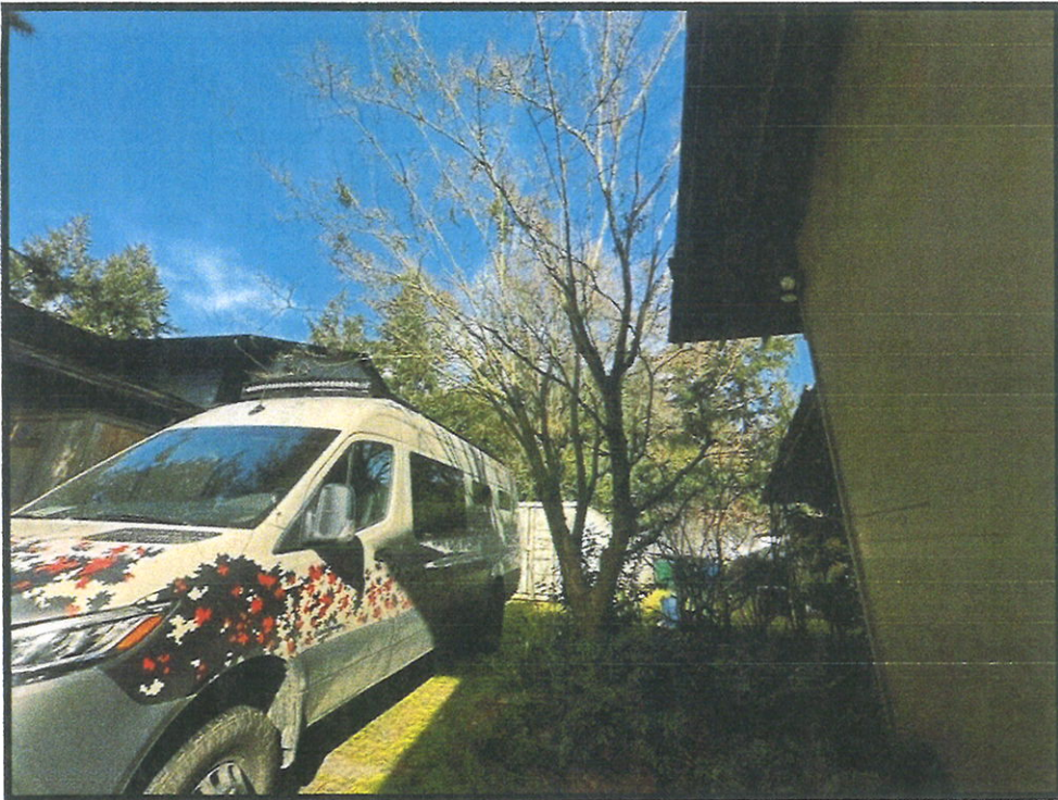
Photo 4. Tree 4, Korean dogwood, at left rear house corner.