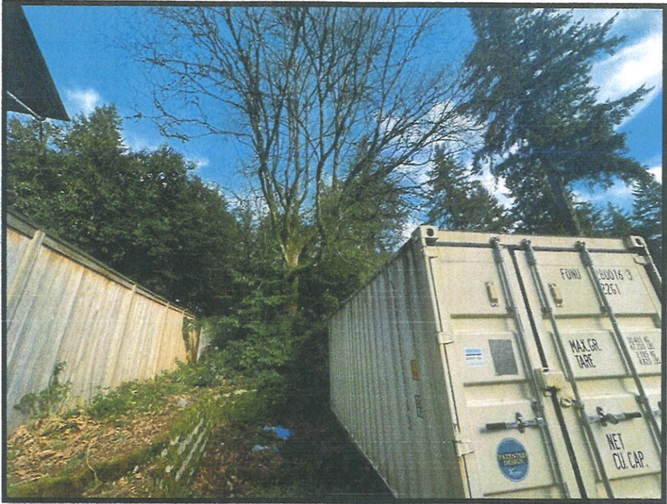
Photo 1. Tree 1, Pacific dogwood, in NW corner of property.