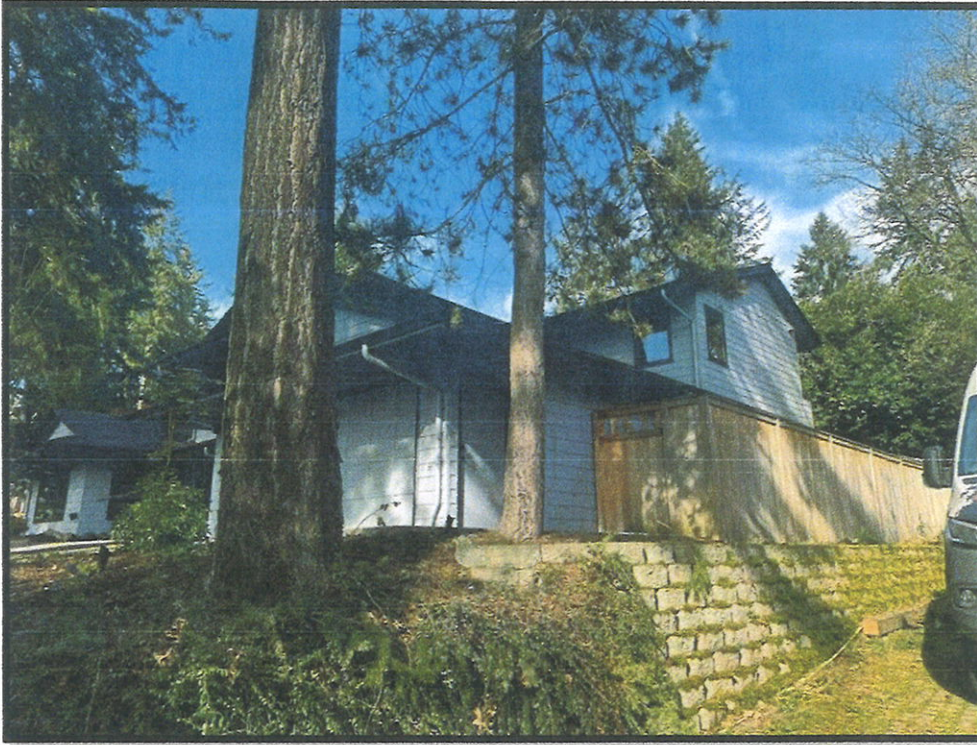
Photo 5. Trees B and C, Douglas fir and Scots pine, along west side of driveway in front.