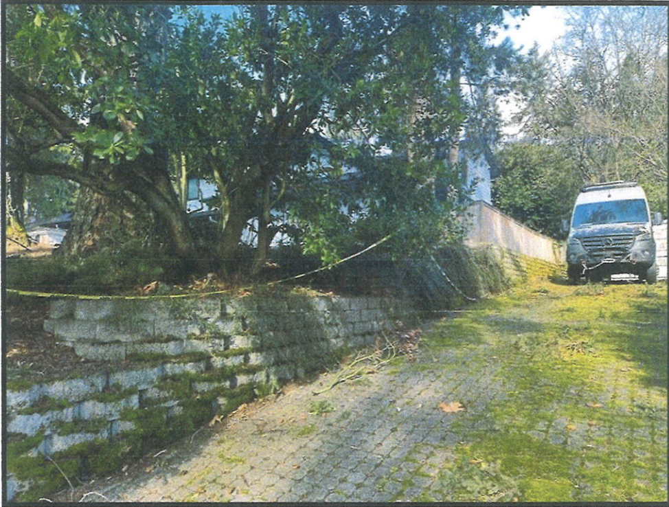
Photo 3. Tree 3, Strawberry tree, along west side of driveway in front.